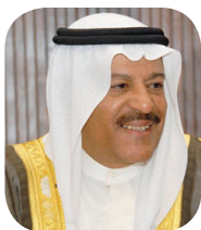
H.E. Ali bin Saleh Al Saleh, president of shoura council of Bahrain, Chairman of ASSECAA (2013)