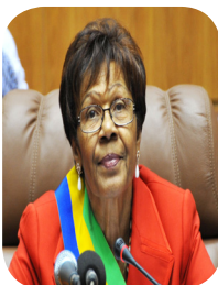
Madam Rose Francis Rogombe, former President of the Senate of Gabon, former chairmanship of ASSECAA(2011)