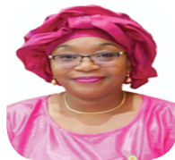
Rapporteur for African countries H.E. Senator DIABY Makani Vice-President of the Senate of the Republic of Côte d'Ivoire, in charge of Education, Culture and Tourism

The network's executive office held its first virtual meeting on May 2, 2024, in which many important topics related to the network's tasks and work were discussed. In addition, opinions, proposals and experiences were exchanged on appropriate mechanisms to realize the network's objectives and tasks, and developing strategies aimed at promoting the network and highlighting it in the regional and international environment. The meeting also evaluated the state of women in the Arab and African countries. Moreover, it identified the future tasks and work of the network by developing plans and work programs and determining future steps required to achieve the network's objectives.