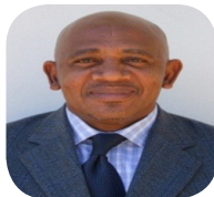
Rapporteur for African countries