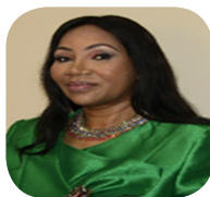
First Deputy Chairwoman H.E Ms. Lindiwe Dlamini, President of the Senate of the Kingdom of Eswatini