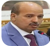
Chairman of the Network

The Network consists of representatives of Senates, Shoora and equivalent councils in Africa and Arab world. Its membership is open to national parliaments and regional unions in Africa and the Arab world. In addition, national parliaments and unions at the international level can gain an observer status after an application is presented to the executive bureau.