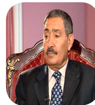
Late H.E. Abdul Aziz Abdul Ghani, former Speaker of Shoora Council, Republic of Yemen , former Chairman of ASSECAA from (2004-2008)