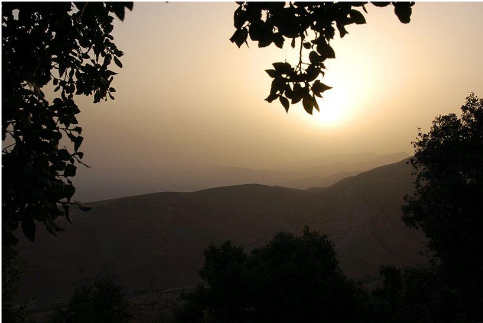
Nature near to Ouarzazate